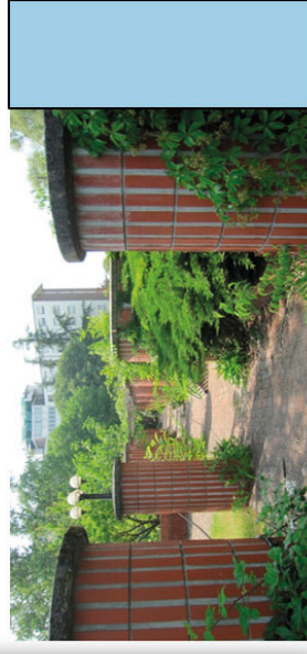
Figure 1. Localization of the garden areas that needs to be recovered and re-designed