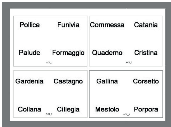
Figure 1. Areas of interest (AoI)

The WMT was presented through an eye tracking device, model «iAble© - MyTobii®» («D10» version). Experiments were conducted in a screen resolution of 1024 x 768. The eye tracker was calibrated to each participant's left and right eyes before the experiment. A stabilized viewing position and distance were provided with a chin rest (distance from the screen was constantly 50 cm). The eye tracker allowed definition of the areas of interest (AoI) within the stimuli chosen for statistical analysis of the eye tracking parameters. AoI clusters refer to selected specific areas that were used for recalling details of the images.