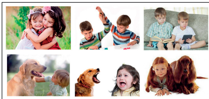
Figure 1. Examples of child-child (CC: top) and child-animal (CA: bottom) interactions with positive (left), negative (center) and neutral (right) valence