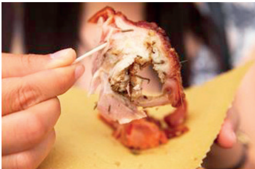
Figure 1. – Colour saturation, light and details (vkeong, 2010, Rome).

Pictures become the tourist’s demonstration of reality, evidence of having been at the destination, of their perceptions and feelings, in those places already seen in and mediated through brochures and travel guides (Francesconi 2014) before leaving. Through pictures, readers identify those places worth going sightseeing and the memories to bring back (Urry 2002) ( Fig. 1 ).