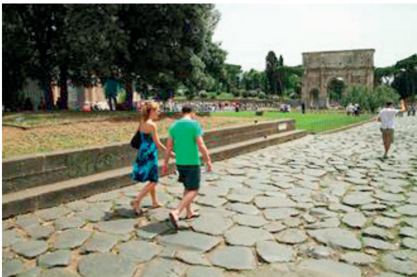
Figure 2. – Interpersonal relationships in pictures (vkeong, 2010, Rome).

People are rarely present in pictures, they appear at a certain distance, both physical and interpersonal, normally walking away from the viewer. They represent tourists suggesting the reader to follow them (see Fig. 2 ). The presence of several people symbolises public distance ( Fig. 3 ), tourists who want to differentiate themselves from other tourists. When locals are portrayed, they are normally undertaking traditional, real, routine activities. Most of the times guests and hosts are co-present. They hold diverse roles and perform different functions (e.g. client/service-provider). This picture encourages "in the tourist-viewer a process of identification" (Francesconi 2014, 82). The co-presence of tourists and locals also symbolises the acceptance of the former by the latter, their welcome, their sharing of places and situations, the tourist's experience of the 'real thing'. Moreover, if we consider circumstantial elements, which "provide information concerning the setting of processes" ( ibidem ), generally foregrounded through size, position, light, colour effects and details, the beauty, uniqueness, authenticity of the represented is enhanced.