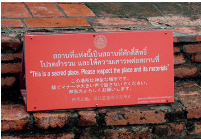
Figure 1. – A multilingual sign at Ayuttawa temple.

As we noted earlier, of interest to us was to explore the following questions: what tourist identities and sets of practices were indexed by the signs? What representations and boundaries between Eastern and Western tourists were constructed through signage? Here we will particularly focus on Thai and English signs.