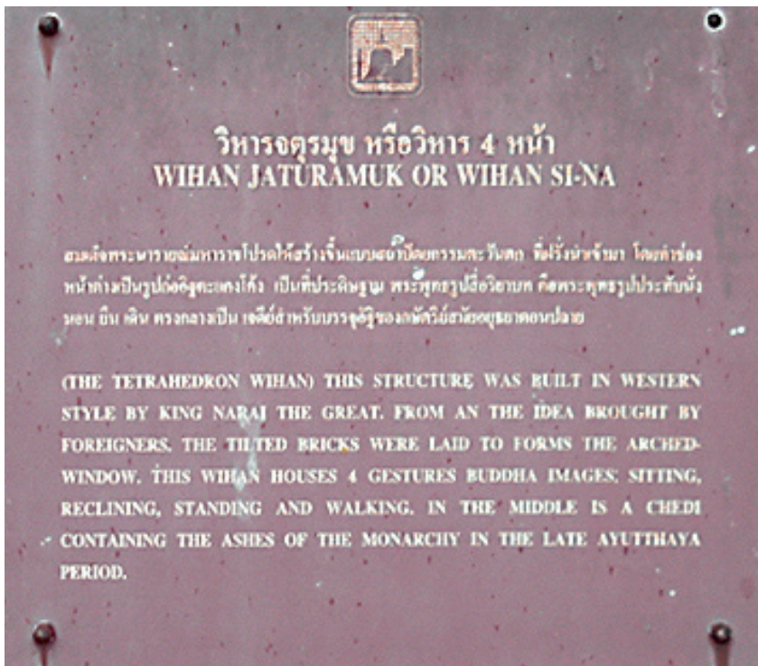
Figure 5. – Wihan Jaturamuk.

The brown color of the sign indicates that it is an official board put up by the Thailand Tourist Authority (TAT) aimed at giving historical information about what the visitor is seeing in the landscape. They are reminiscent of the colors that can be found in many tourist sites, for example UNESCO heritage sites. Signs with an identical 'corporate identity' are found throughout all the sites maintained by the TAT. The first sign notes a 'foreign' influence on the landscape referring to the borrowed architectural styles found in local temples and attesting to the international commercial and cultural ties in existence under King Narai the Great (1656-1688).