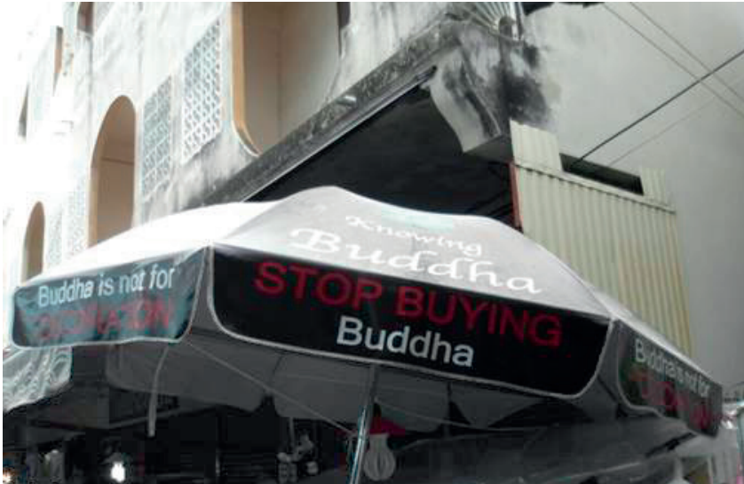
Figure 11. – The ‘respect the Buddha’ umbrella shade Amphawa (it reads on the left: “Buddha is not for decoration”; “Stop buying Buddha”).

Despite the fact that such signs are necessary to prevent unwanted or embarrassing behaviour, there is a disconnection between the signs that construct a foreigner as ‘other’ and those that do the opposite, and try to enable tourists to interact with the geosemiotic landscape as locals do. That is to say, there are very few signs in the temples or heritage sites in our survey that explain how a tourist should interact with the temple. We are not suggesting that all signs in Thai temples should be exact literal translations from Thai into other languages. Rather we suggest that what might be needed are signs, pamphlets and brochures that instead of creating and indexing a foreign other, explain tourists how one can interact with a temple in an appropriate and respectful manner.