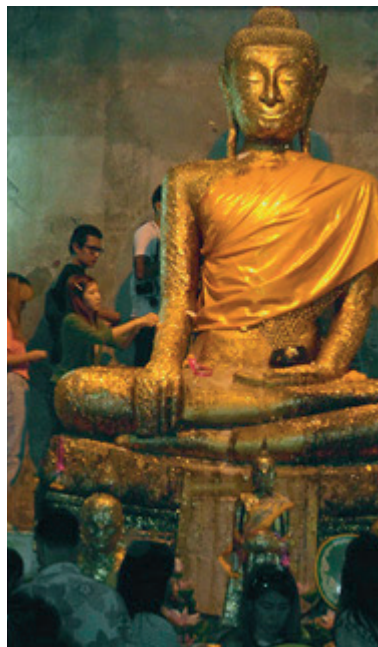
Figure 2. – Placing a gold leaf on the image of Buddha.

While typical, the above sequence can emerge differently depending on the temple one visits. For example a temple may have several Buddha statues on the premises in addition to a variety of types of donation through which one can make merit. We emphasize this to illustrate that the interaction between the built environment and tourists is not static in this context, touching the statues of the Buddha with the gold leaf is a practice which would be harder to imagine for example in a Catholic Church where crucifixes typically hang far up on the ceiling and are otherwise inaccessible, available for adoration but not for physical contact.