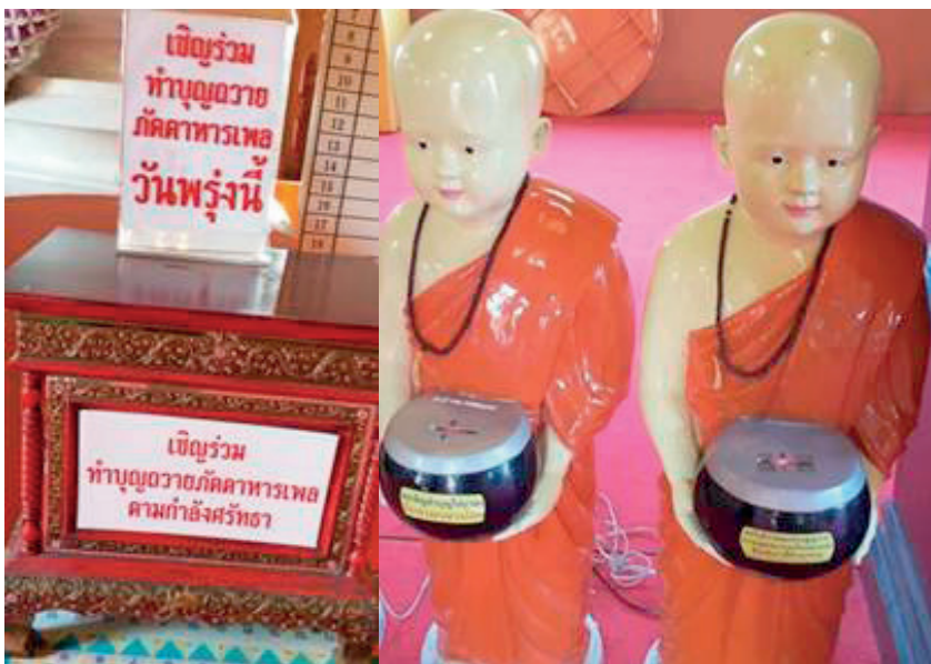
Figure 4. – Request for donation for monks' meals and for young monks (left) and 'happiness' (right).

The top zones typically correspond to some 'idealized' aspiration (here merit, happiness, better life, enlightenment), while the bottom is where the 'real' and concrete is located (in this case, the donation of money). Temples are full of such overt and covert discourses (Scollon and Scollon 2003) which constitute many 'calls for actions' directed towards Buddhist adherents.