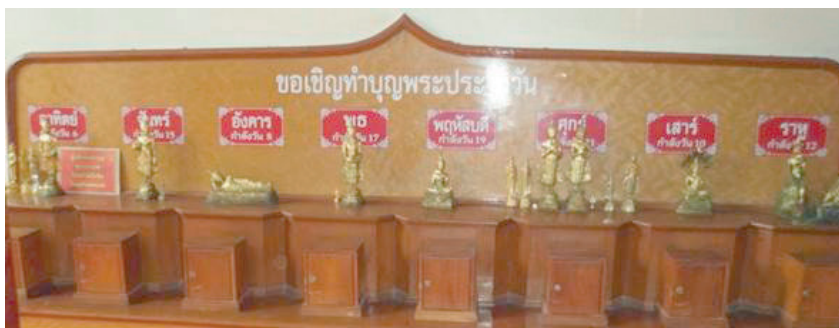
Figure 3. – Making merit based on your day of birth.

The text above and behind the Buddha image on the far left reads wan atit in Thai, which is Sunday, and is followed on the right by the remaining six days of the week. Notice that here there are eight Buddha images, the last one on the right hand side reads rabu in Thai and refers to the Buddha image for those people who were born on a Wednesday evening. Each different day of the week has its own distinctive Buddha image. In addition one will also notice that below each of the names for the days of the week, a number is represented. This number is the lucky number for that day of the week. For the purposes of making a donation one would possibly perform an action that number of times, e.g. saying a prayer, or possibly leave a donation in that amount. So for example the lucky number for wan jan or Monday is 15, so one could make a donation 15 times, say a prayer 15 times, etc.