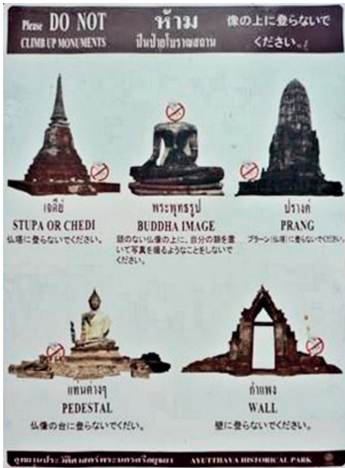
Figure 9. – Multilingual do not sign at Ayutthaya.