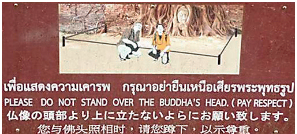
Figure 10. – Multilingual sign at Ayutthaya.