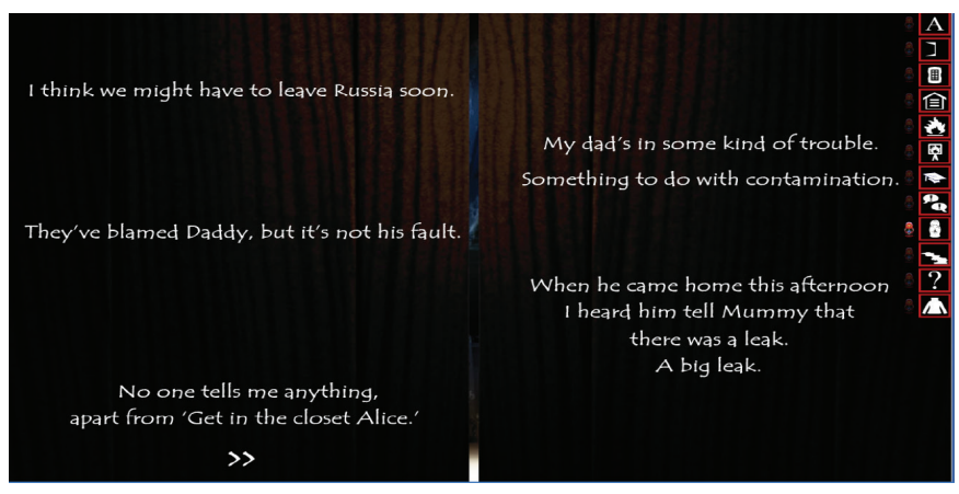
Figure 4 – Inanimate Alice, Episode 3: Russia (Trouble).

The significance of Inanimate Alice is built across multiple media and modes of communication and there is a constant invitation to search meaning across different elements of the story. This multimodal literacy is necessary, for example in episode 3, when we confirm the importance of how sound, image and written text are defined and filtered through Alice's perspective (see Figure 4 ).