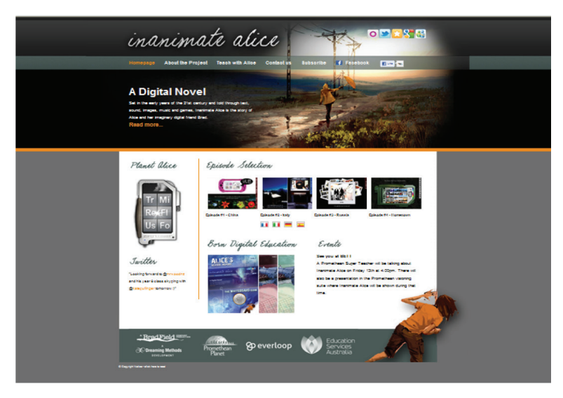
Figure 1 – Inanimate Alice (Homepage).

Historically, the various modes of communication have competed with one another. The replacement of the older narration by information, of information by sensation, reflects the increasing atrophy of experience. [...] This is the nature of something lived through (Erlenis) to which the reader has [to give] the weight of an experience (Erfahrung). (Benjamin 1991, 190)