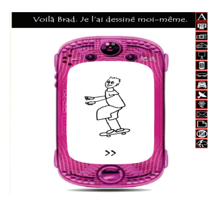
Figure 3 – Inanimate Alice, Episode 1: China (Allumer Console).

We never see or listen to Alice nor anyone, except through their words displayed on the screen, and except for Brad's voice – Alice's virtual and imaginary best friend. The strong presence of electronic games in Alice's life allows her to create Brad (her only friend until she turns 14) who lives inside her baxi – an electronic device which takes photographs, makes videos, plays music, makes phone calls, accesses the web, etc. In this multimedia electronic device have converged different applications that allow Alice to describe her adventures, to draw, to paint, to make drafts and to be informed. ( Figure 3 )